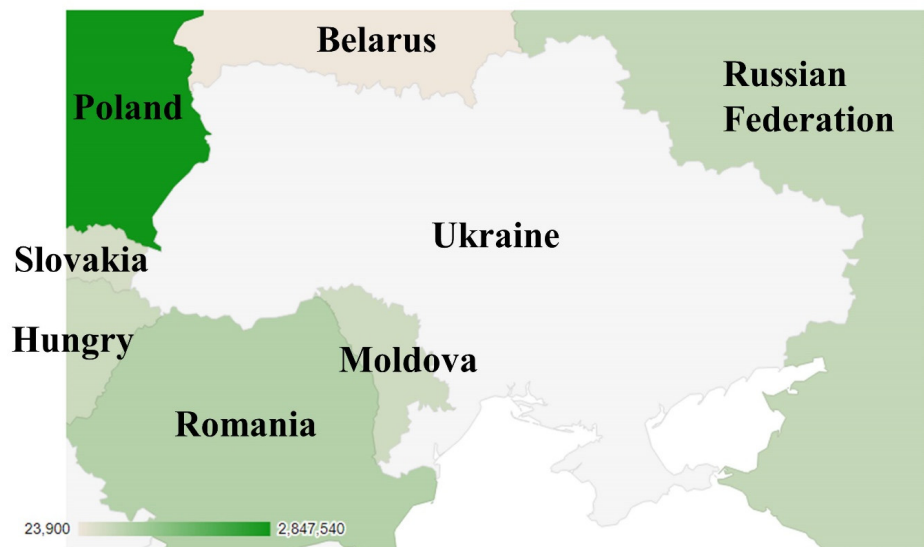
Distribution of refugees in neighbouring countries to Ukraine as of 20 April 2022